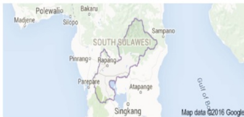
Figure 2. Sidrap Regency, Statistics Indonesia of Sidenreng Rappang Regency, 2016

This research conducted in Sidrap Regency, South Sulawesi Province, Indonesia. Sidrap or Sidenreng Rappang Regency is a regency of South Sulawesi Province in Indonesia.